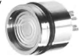
SERIES 8 LOW PRESSURE

Each pressure transducer is subjected to comprehensive tests for its pressure response and temperature characteristics, and is delivered with an individual calibration certificate stating the characteristics as well as the results of all tests which were performed. Special testing is available if demanded by the customer.