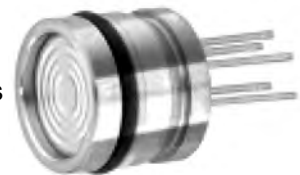
SERIES 8 HIGH PRESSURE