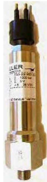
Series 33 Subsea

PA-33 / 35 S Sealed Gauge, Zero at 1 bar abs.