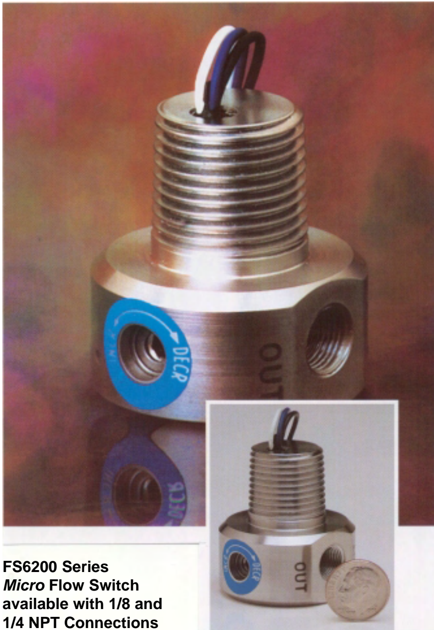
FS6200 Series Micro Flow Switch available with 1/8 and 1/4 NPT Connections

Adjustable Gas Series - Range 30 sccm to 20 slpm