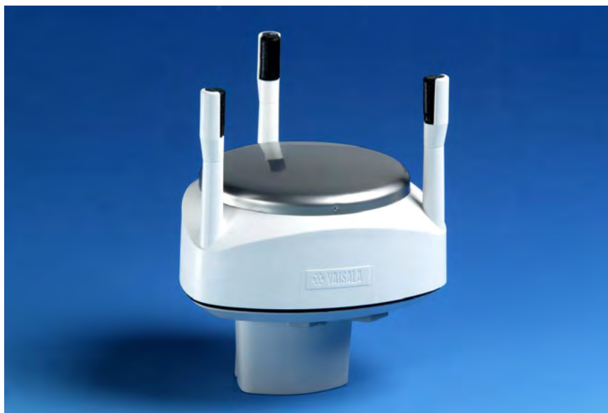
The Vaisala WINDCAP® Ultrasonic Wind Sensor is designed for demanding applications where stable and inexpensive wind measurements are required.